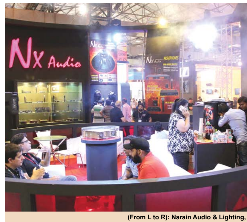
(From L to R): Narain Audio & Lighting, Beyerdynamic India, Pope Professional Acoustics