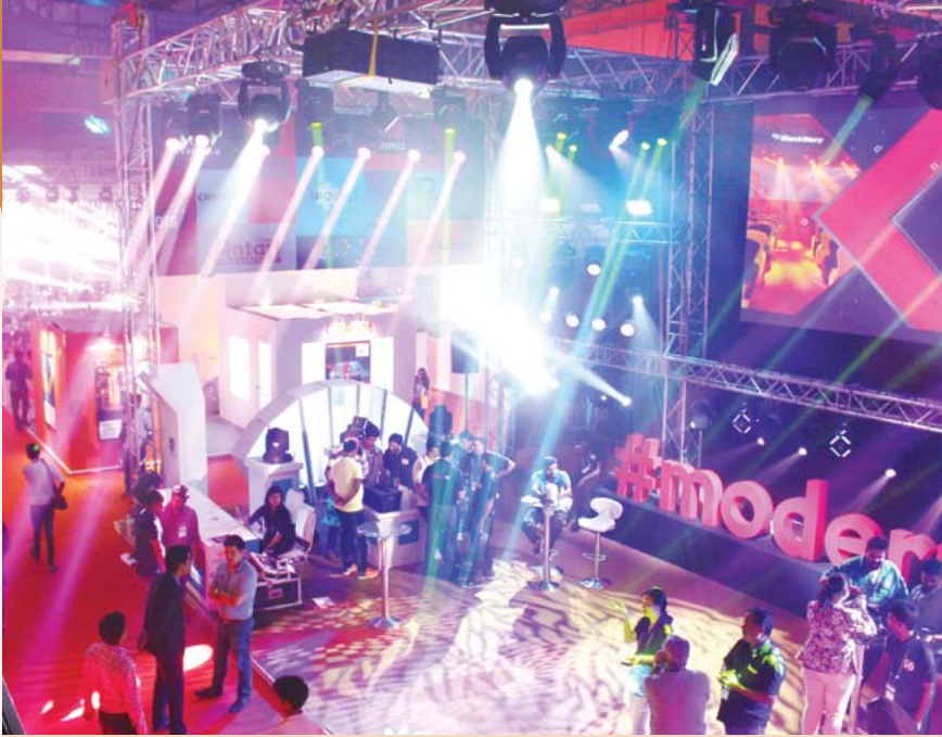
(From L to R): Modern Stage Service, Acoustic Arts, Beatbox Entertainment