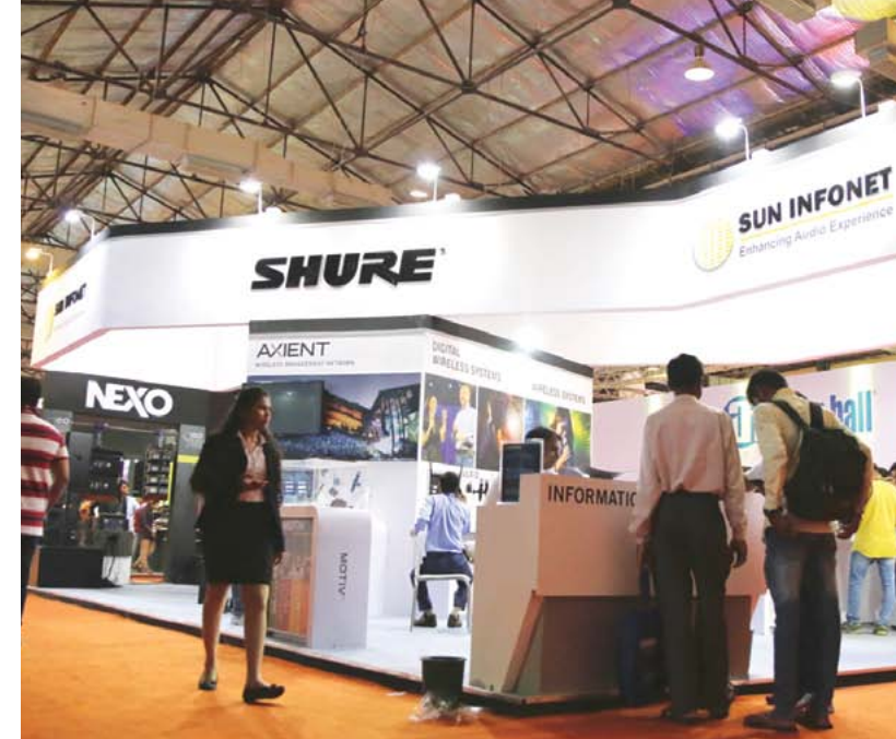
(From L to R): Pro Musicals, Premier Industrial Importers, Audioplus and Sun Infonet

with their complete bouquet of products from their principals Avolites, Robe, Anolis, Robert Juliat, Capture and of course the audio brands like Martin Audio, Powersoft etc. were present in Hall 1