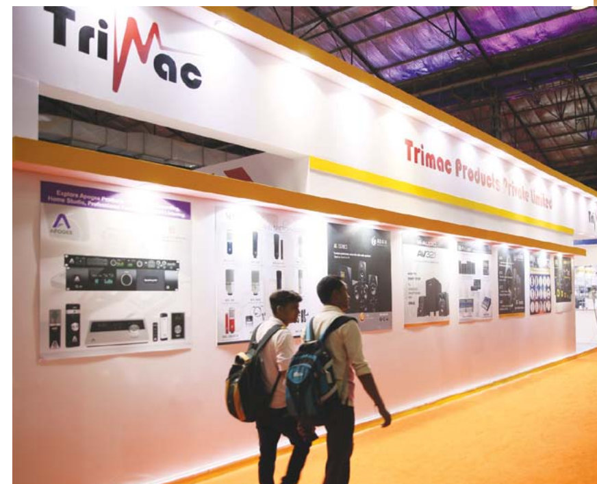
(From L to R): Harman International (India), Integrated Entertainment Solutions and Trimac Products displayed their range of brands and products