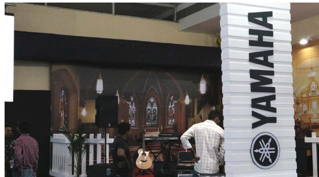
The House of Worship area at the Yamaha hall at PALM Expo

Lighting, Jia lighting, LBT Electronics, Cine Audio Viso, Imax Lighting and Star Dimensions India were in full attendance in Hall 5. First time exhibitors Nicolaudio Group , one of the leading companies in lighting control technology were also present in Hall 5.