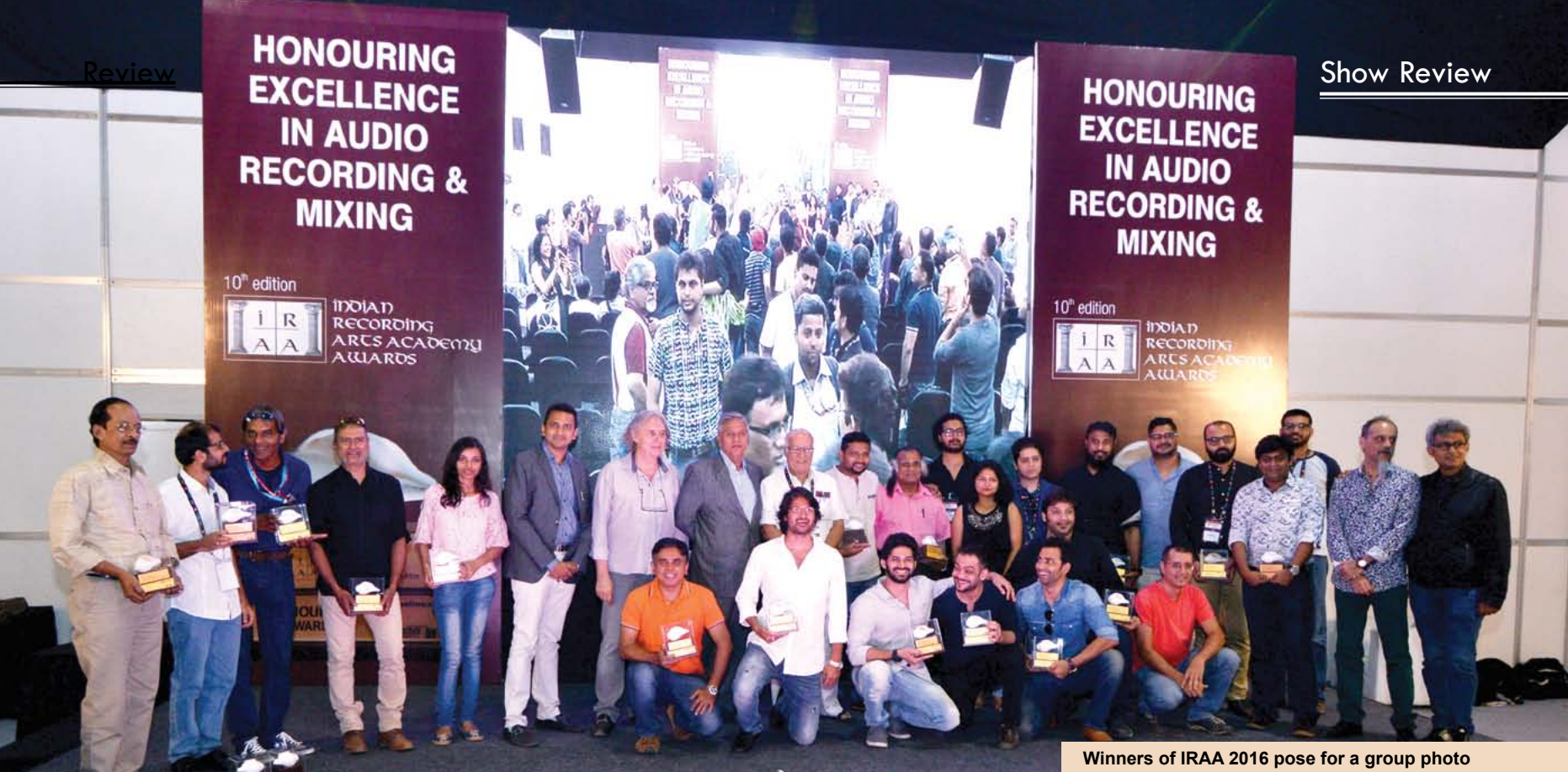
Winners of IRAA 2016 pose for a group photo