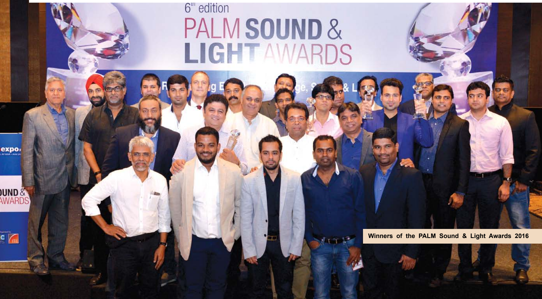
Winners of the PALM Sound & Light Awards 2016