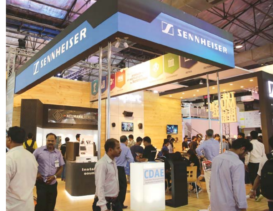
(From L to R): P Audio, Thailand; Adam Hall Asia, Singapore; Hi-Tech Audio Systems, New Delhi; Sennheiser Electronics, Gurgaon