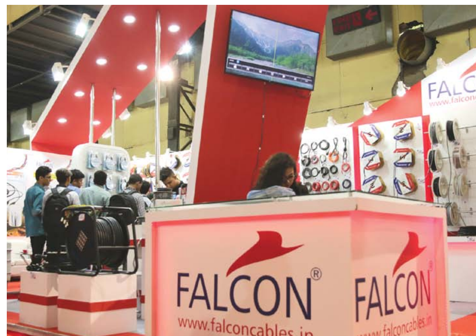
Falcon Cables booth at PALM