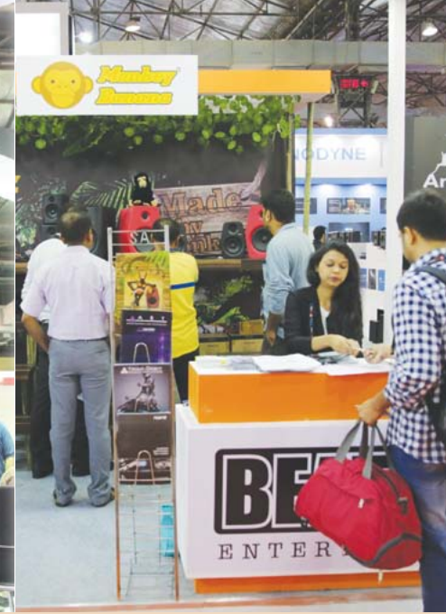
and Bose Corporation India booths at the PALM Expo