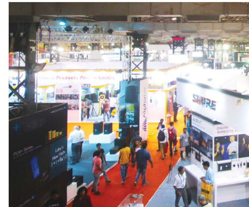
Floor View of Hall 1 at the Expo