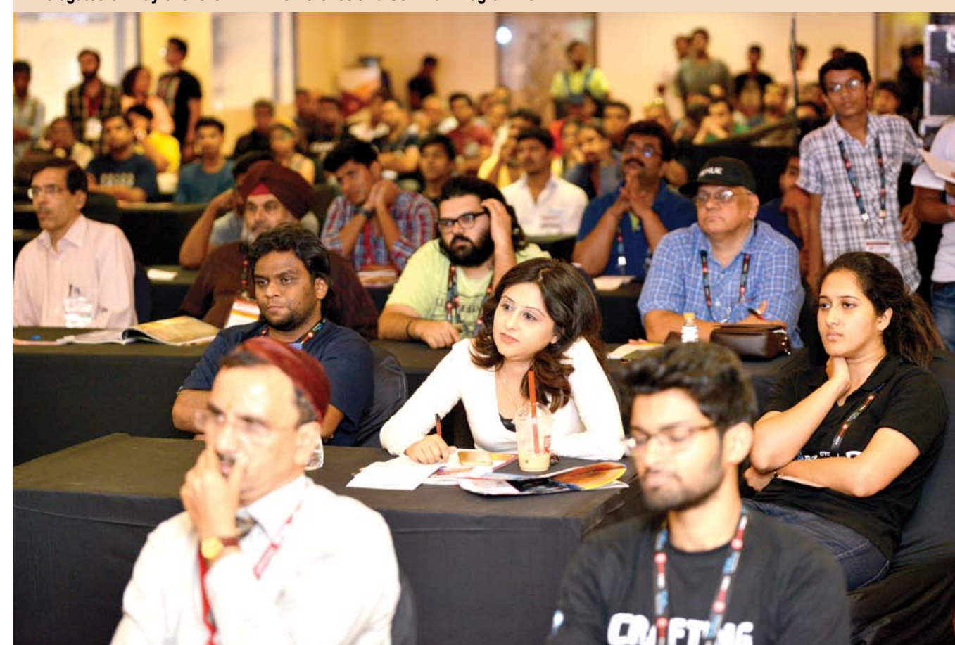
Delegates on Day 3 of the PALM Conference and Seminar Programme