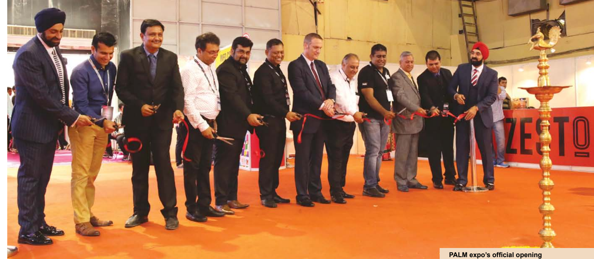
PALM expo's official opening